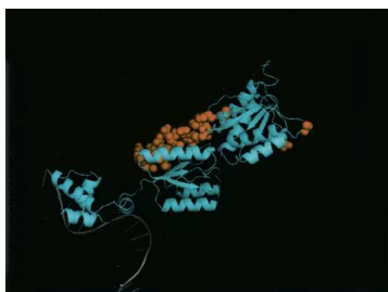
Figure 3. Three-dimensional structure of PurR. Sites that show evidence of positive selection ( P < 0.01 ) are depicted as orange spheres. DNA strand is shown as gray ball-and-stick.

A number of rhs genes (Hill et al. 1994) show remarkably strong evidence for positive selection. The Rhs proteins have no known function, but properties predicted from their primary sequence suggest that they may be cell surface, ligand-binding proteins (Hill et al. 1994). They are not expressed under routine conditions in the laboratory; however, Hill et al. (1995) suggest that they respond to environmental signals and play a role in the success of the cell in natural settings. Hill et al. (1995) hypothesized that Rhs function relates in a key way to the periodic selection event(s) that influence E. coli population structure. However, as their function is still largely unknown, the exact causes for positive selection are hard to determine in this group of genes. The fact that rhs genes is the group of genes showing the very strongest evidence for positive selection in the E. coli genomes, suggests that these genes should be awarded more attention. They may possibly be involved in adaptations associated with changes in the environment, e.g., host shifts.