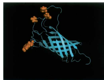
Figure 2. Three-dimensional structure of outer membrane protein A (OmpA). Sites that show evidence of positive selection ( P < 0.01 ) are depicted as orange spheres.

MdtC is part of the multidrug resistance cluster mdtABCD , where mdtB/C are encoding a heteromultimeric transmembrane complex located in the inner membrane. MdtABC is involved in resistance against bile salts and antibiotics (Nagakubo et al.